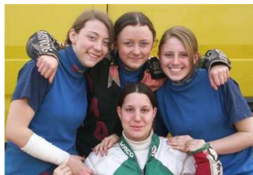
The Sheffield Angelz

taught us like we were lads, which helped us a lot. The lads at the training track have reacted very well giving us advice and we are great friends with most of them. A lot of lads on forums online have said we won't succeed, that we won't last long and we won't be able to win anything. Some lads like the competition from girls, so all around it's a pretty good reaction from them."