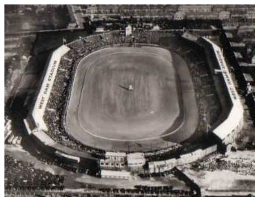
Custom House Stadium – Home of the Hammers

The streets in the area were given names of some of the older West Ham riders, but none of the greatest ever team, the 1965 Hammers, were remembered.