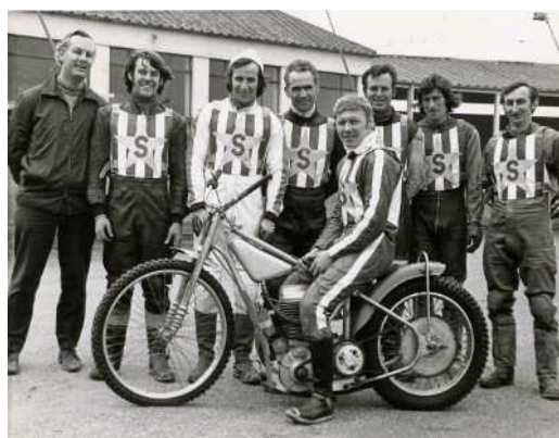
Sunderland Stars 1972