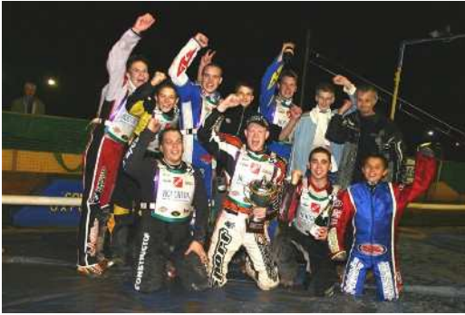
Conference League Champions – Oxford Academy

Oxford Silver Machine Academy's progressive youth policy was rewarded when they clinched the Conference League title. Thankfully the new Oxford promotion will allow them to defend their title in 2006. Wimbledon and Weymouth finished in second and third place respectively.