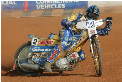
World Champion – Tony Rickardsson

Tony started the season with five titles under his belt and hoping to clinch one more to equal Ivan Mauger's record haul. He started off in the right way by storming to seven consecutive race wins in the series opener at Wroclaw. The new formula saw each rider take part in five qualifying heats, then the best progress to the semi-finals and final. Tony won the lot and established himself as the man to beat.