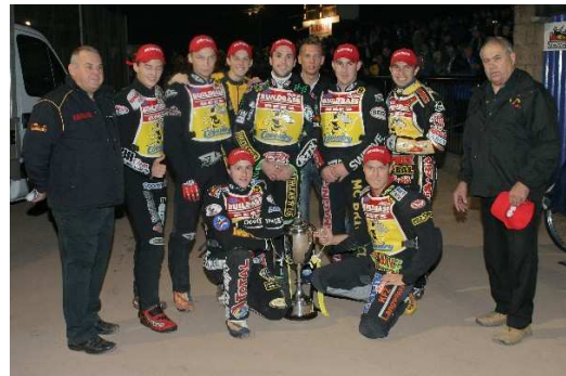
Elite League Champions – Coventry Bees