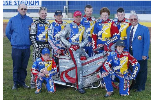
Premier League Champions – Rye House Rockets

The also won one of the league's other big competitions when they defeated Workington in the Premier Trophy final. The two sides had battled though the Southern and Northern qualifying groups.